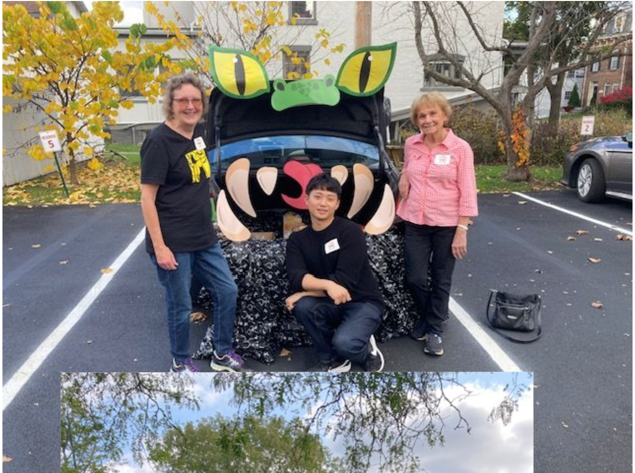
Trunk or Treat