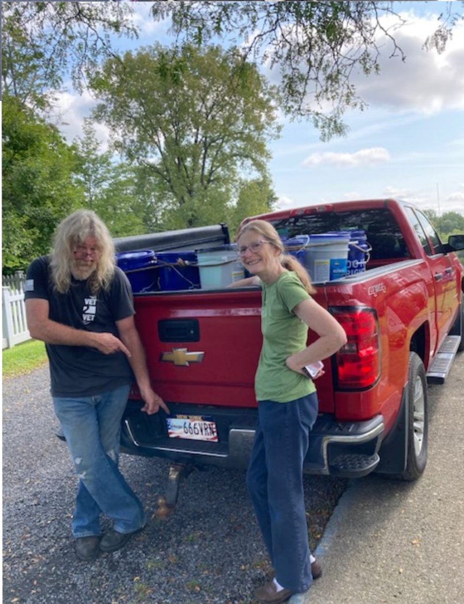
Delivering 100 flood buckets our parish put together!